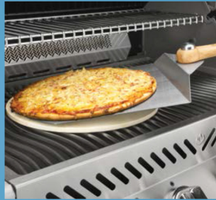
70003 – Pizza Spatula