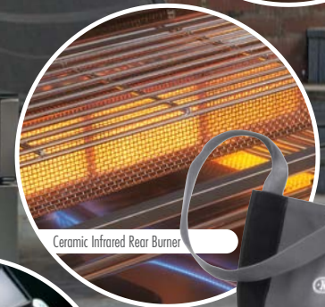
Ceramic Infrared Rear Burner