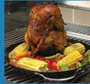
56020 – Wok & Beer Can Roaster