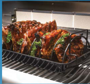
56011 – 3 in 1 Non-Stick Rib/Roast Rack