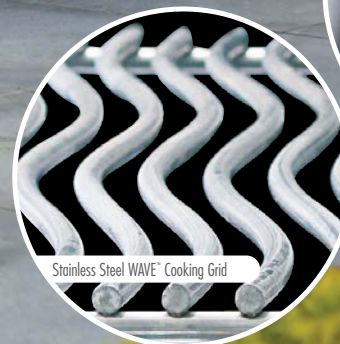
Stainless Steel WAVE® Cooking Grid