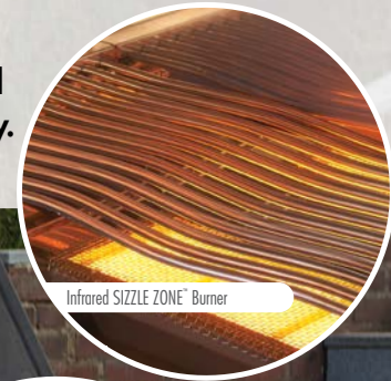
Infrared SIZZLE ZONE® Burner