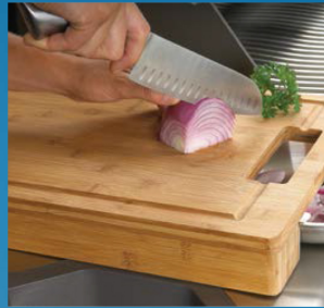
70012 – Professional Cutting Board