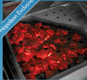
67731 – Charcoal Smoker Tray