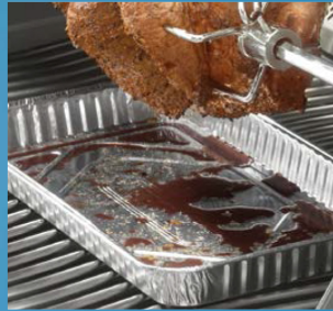
62008 – Large Drip Pans