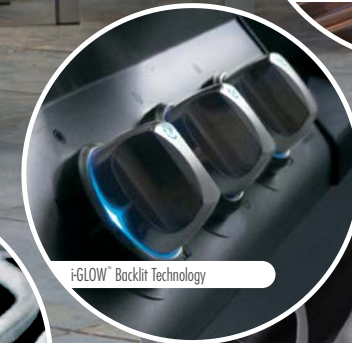
i-GLOW® Backlit Technology