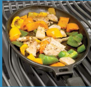
56003 – Cast Iron Skillet