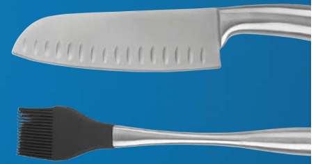
70012 – Professional 5 pce Tool set