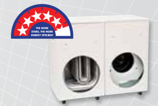
Non-condensing Five Star