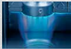
The InShot Burner™ shapes the flame for optimum efficiency