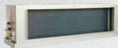
Indoor Coil U3509A