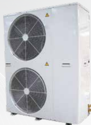
Outdoor Unit U3009A