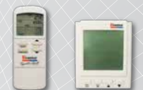
Spectrolink Comfort Controller