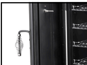
Heat resistant door handles and heavy duty door seals