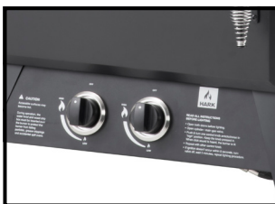
Easy start, automatic ignition