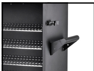
Strong side handles and door fasteners