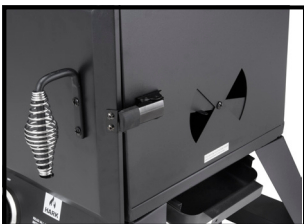
Two adjustable dampers for heat and smoke regulation