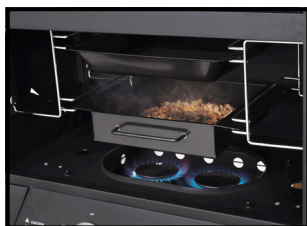
Porcelain coated wood chip box and water bowl