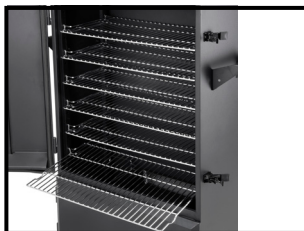
Extra-large cooking area with six adjustable shelves