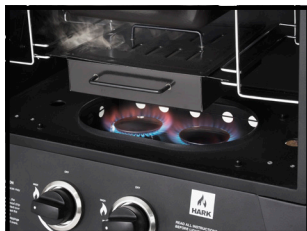
Two stainless steel burners fitted with a flame failure device