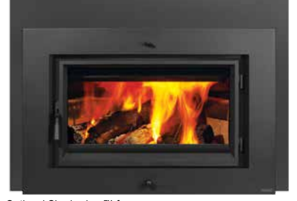
Optional Shadowbox™ face