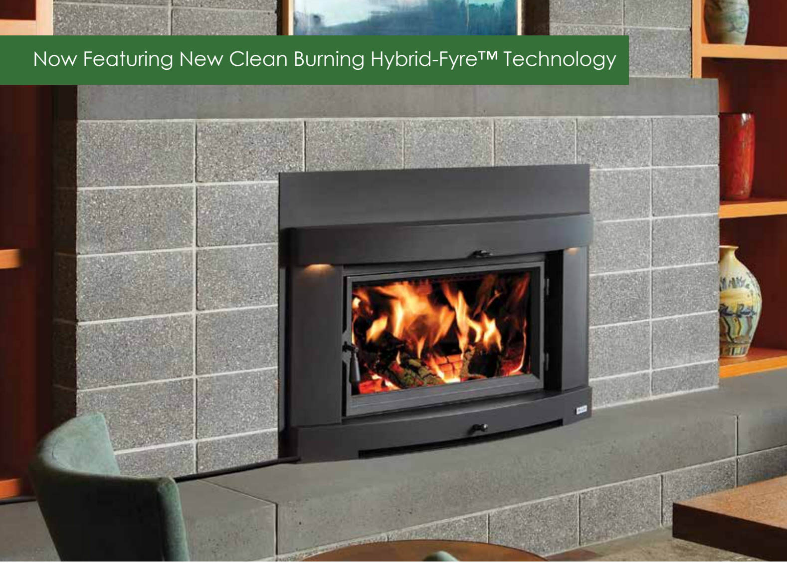
Shown with Cypress™ face and one piece surround panel

The Flush Wood Large Hybrid-Fyre™ fireplace insert features the exclusive clean burning Hybrid-Fyre™ Technology. Hybrid-Fyre™ Technology is a fusion of known wood combustion (kiln fired firebrick, stainless baffles, and stainless steel secondary combustion air tubes, with the addition of our catalytic assist technology. Primary combustion burn occurs in the firebox with our secondary tubes re-burning gases before they leave the firebox, we are then making those same gases pass through a catalytic combustor leaving virtually no smoke to exit the appliance. The net result of this is a super clean burning insert, with emissions of just .90 grams with hardwood. Also with that reduction in emissions comes almost zero carbon mononxide remaining through all burn cycles. We are taking clean burning to an unmatched level of efficiency. What this means is more heat from less wood, and greater savings on your heating cost! This insert will heat up to 300sqm, with up to 12 hours burn times. The Lopi Flush Wood Large Hybrid is standard with a convection fan.