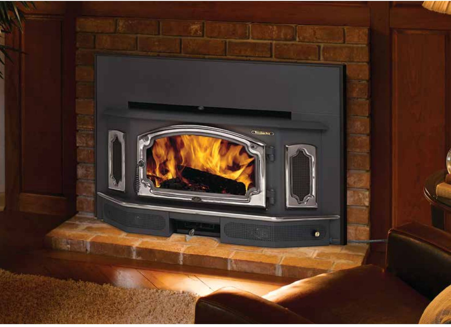
Shown with pewter door and 8" surround panels.

The Freedom Bay is proof that beauty and function really can be engineered to go hand in hand. At an emission rate of only 2.5 grams per hour, it is the cleanest burning large insert ever tested and approved by the EPA. The bay "windows" are actually side convection chambers that allow air to circulate around the huge firebox and return to the room heated. Because it's flush mounted, the Freedom Bay includes a quiet, yet powerful fan (standard) to produce superior air flow. The Freedom Bay also comes with the choice of a solid brass, black painted or pewter door and trim, making this insert our most distinctive and elegant heater for larger homes.