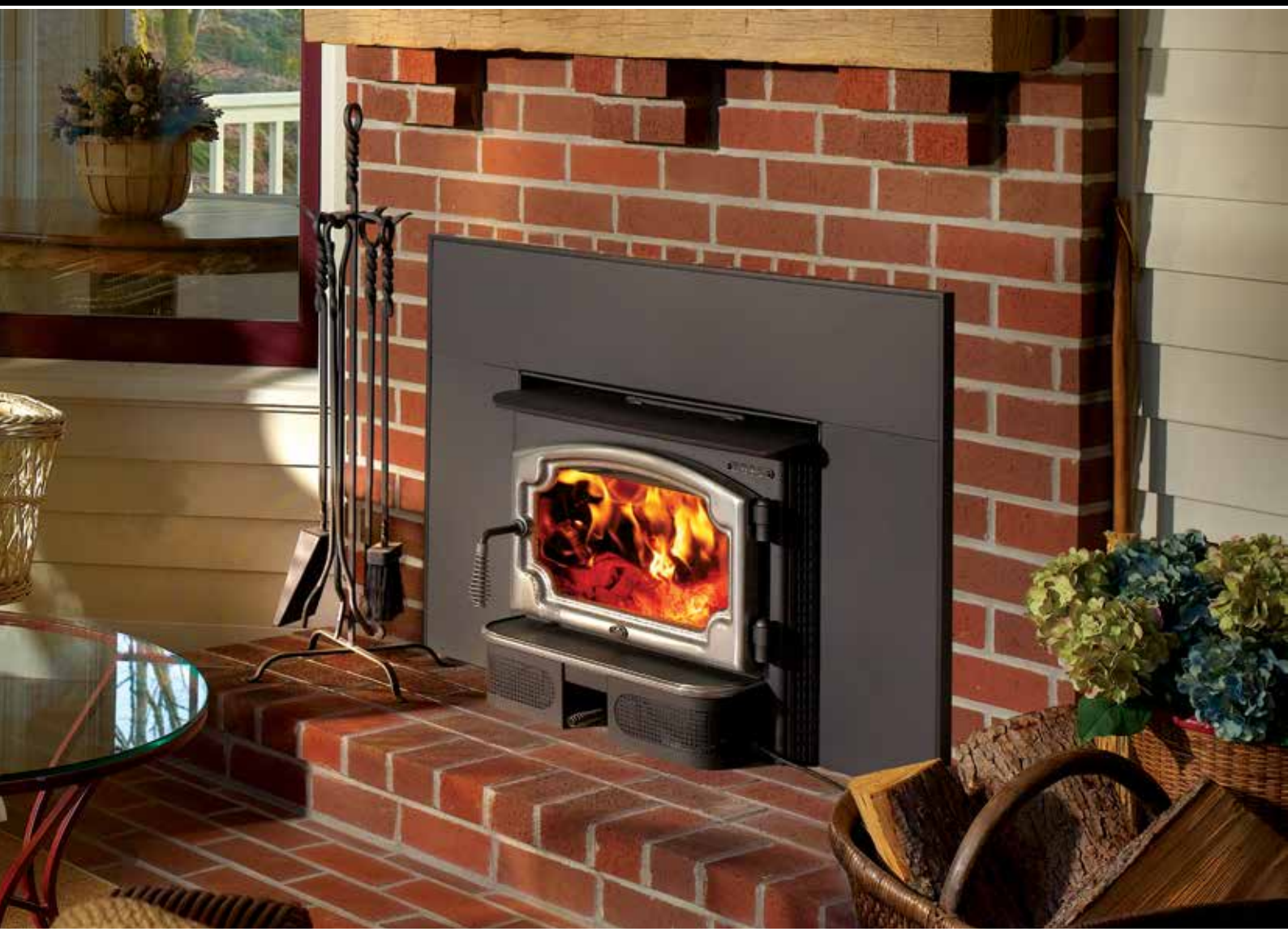
Shown with the optional pewter door and ashlip trim, optional convection fan and 8" surround panel.

The Answer is a terrific way to heat a secluded room or small home. It conserves space by mounting flush into your existing masonry fireplace, yet it still offers advanced features like a five-sided convection chamber to distribute warm air evenly and a single air control for easy regulation of burn and heat output. The Answer's door opening is 2 inches taller than most other small inserts, so you can load it with larger pieces of wood. The Answer has the largest firebox available in a small insert, so it offers longer burn times and gives you more time to enjoy watching the flames between fuel loadings.