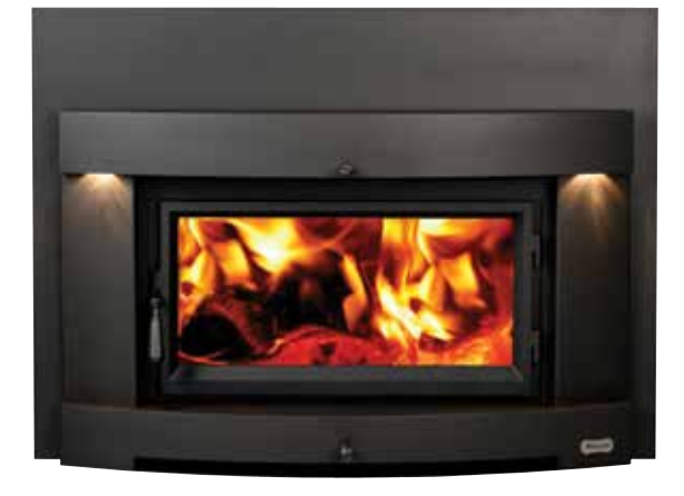
Optional Cypress Face with Accent Lights