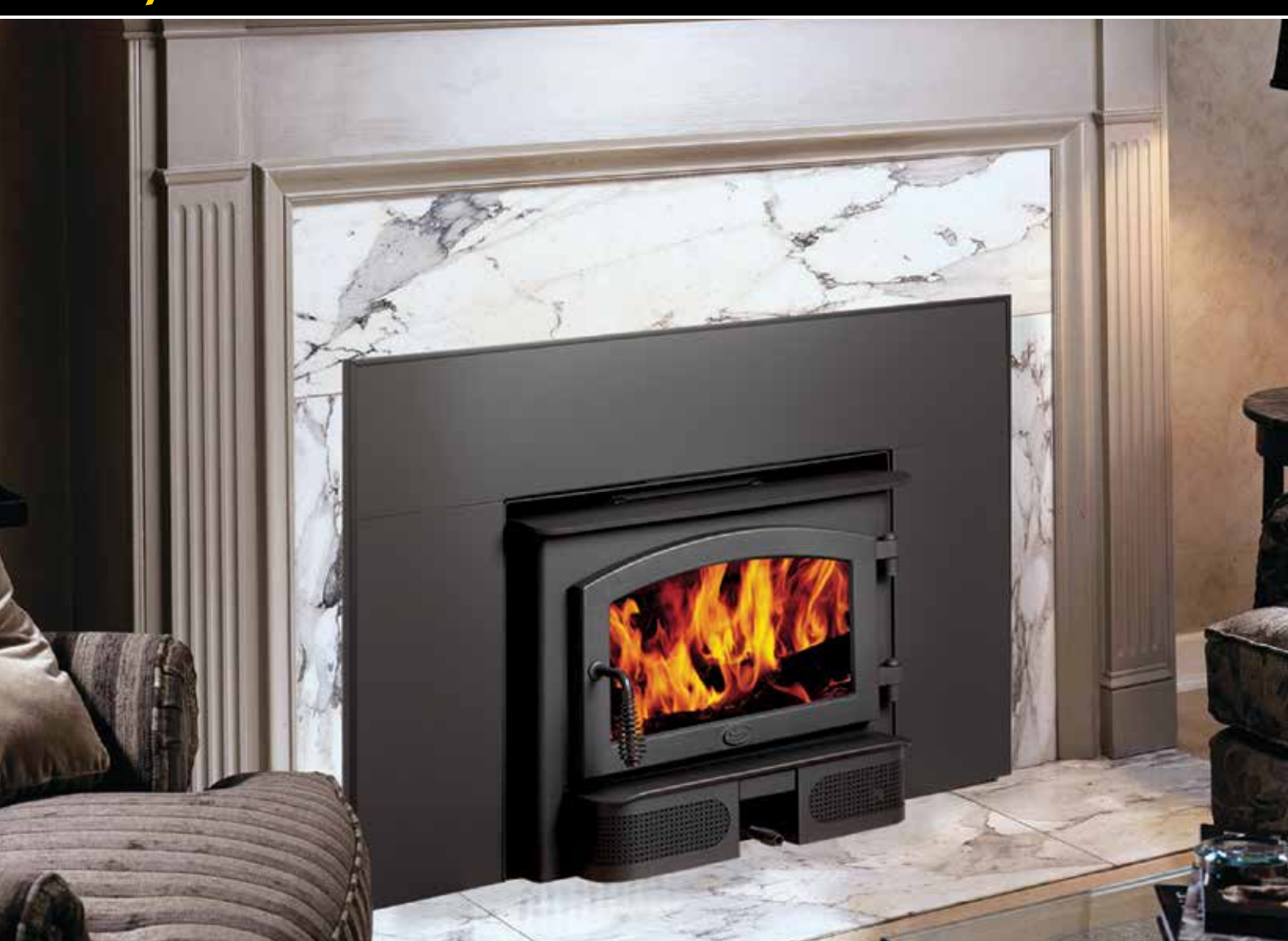
Shown with the optional convection fan and 8" surround panel

Now experience the performance and quality you've come to expect in Lopi wood stoves in two mid-priced economy fireplace inserts. Without compromising construction or function, Lopi has managed to produce a wood insert line that's designed to be affordable, good looking and just plain heats.