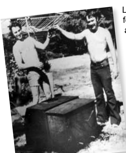
1979 - First Lopi Wood Heater

Lopi wood stoves and inserts have been America's favourite choice in fire for thirty years. Our reputation for solid craftsmanship, reliable performance and unbeatable heating efficiency has been a winning combination year after year, and the favourite fire of families across the nation.