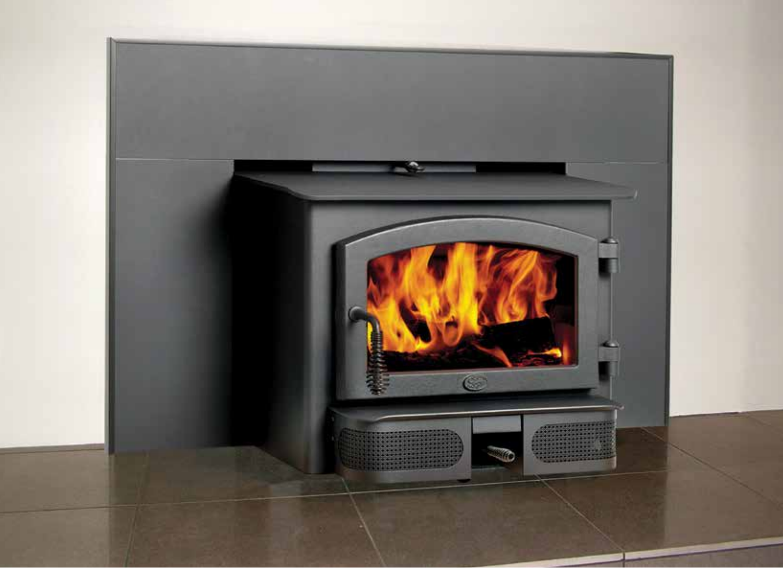
Shown with optional fan and 10" surround panel

With a Republic wood burning insert you can turn your old, inefficient open masonry fireplace into a great heat source for your home. A Republic insert is more than five times as efficient as an open fireplace and features a built-in convection chamber to circulate and distribute heat throughout your home. The model 1750i even features a bypass damper that allows quick and easy fire start-up. Republic inserts will provide your family with reliable heat source - even during power outages.