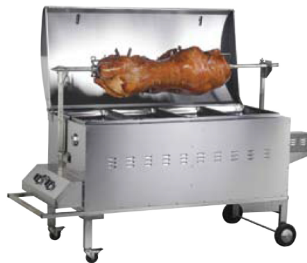
Deluxe Spit Roaster BBQ MODEL No. GSB300

Use as a barbecue grill or spit roaster (grill plates sold separately) Can be used with propane gas or solid fuel Stainless steel body Robust design with wheels for easy moving 2 x powerful 30MJ/h stainless steel burners with piezo ignition 240V rotisserie motor included with 1 piece shaft rated to 30Kgs Lid doubles as a windshield 2 Baskets to hold heat beads