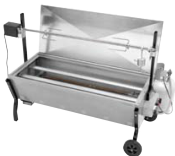
Large Spit Roaster BBQ MODEL No. GSB200

Use as a barbecue grill or spit roaster Can be used with propane gas or solid fuel Grills included for versatile cooking Vitreous enamel coated body Robust design with wheels for easy moving Powerful 18MJ/h stainless steel burner with piezo ignition Combined control valve and regulator with hose Includes 240V rotisserie motor with 1 piece shaft