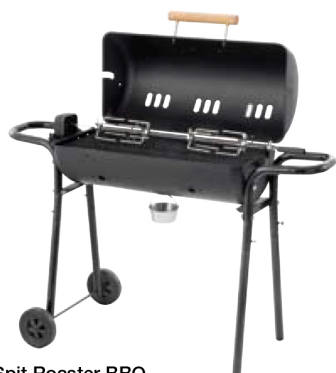
Spit Roaster BBQ MODEL No. GSB100

Use as a barbecue grill or spit roaster Can be used with propane gas or solid fuel Grills included for versatile cooking Vitreous enamel coated body Robust design with wheels for easy moving Powerful 18MJ/h stainless steel burner with piezo ignition Combined control valve and regulator with hose Includes 240V rotisserie motor with 1 piece shaft